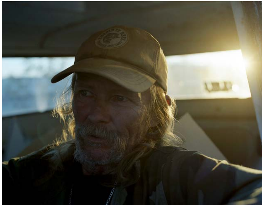
Laura Henno Jack , 2017 Silver print, 55 x 130 cm

3, rue du Cloître Saint-Merri, 75004 - Paris