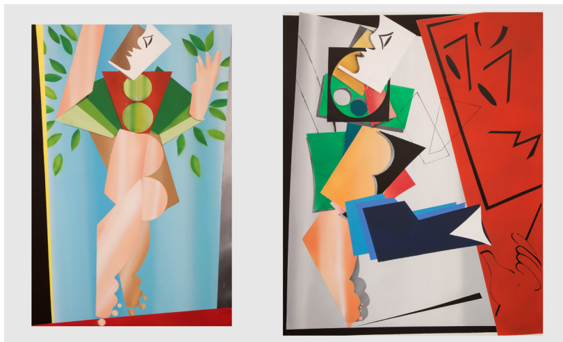
Hoda Kashiha, Apollo Pursuing Daphne , 2020 Acrylic on Canvas, 150 × 220 cm (59 1/16 × 86 5/8 in.)

Her canvases become a fictional space, a moment in which she explores the optical and physical relationship between the fore and backgrounds of the multi-layered pictorial plane, as seen in the work Eyes Never Stop Seeing All Things . The stratification of her work is inspired by the art movement in the 1970s called “Abstract Illusionism” 2 , in which abstract works were shown with a sense of perspective, depth and shadow.